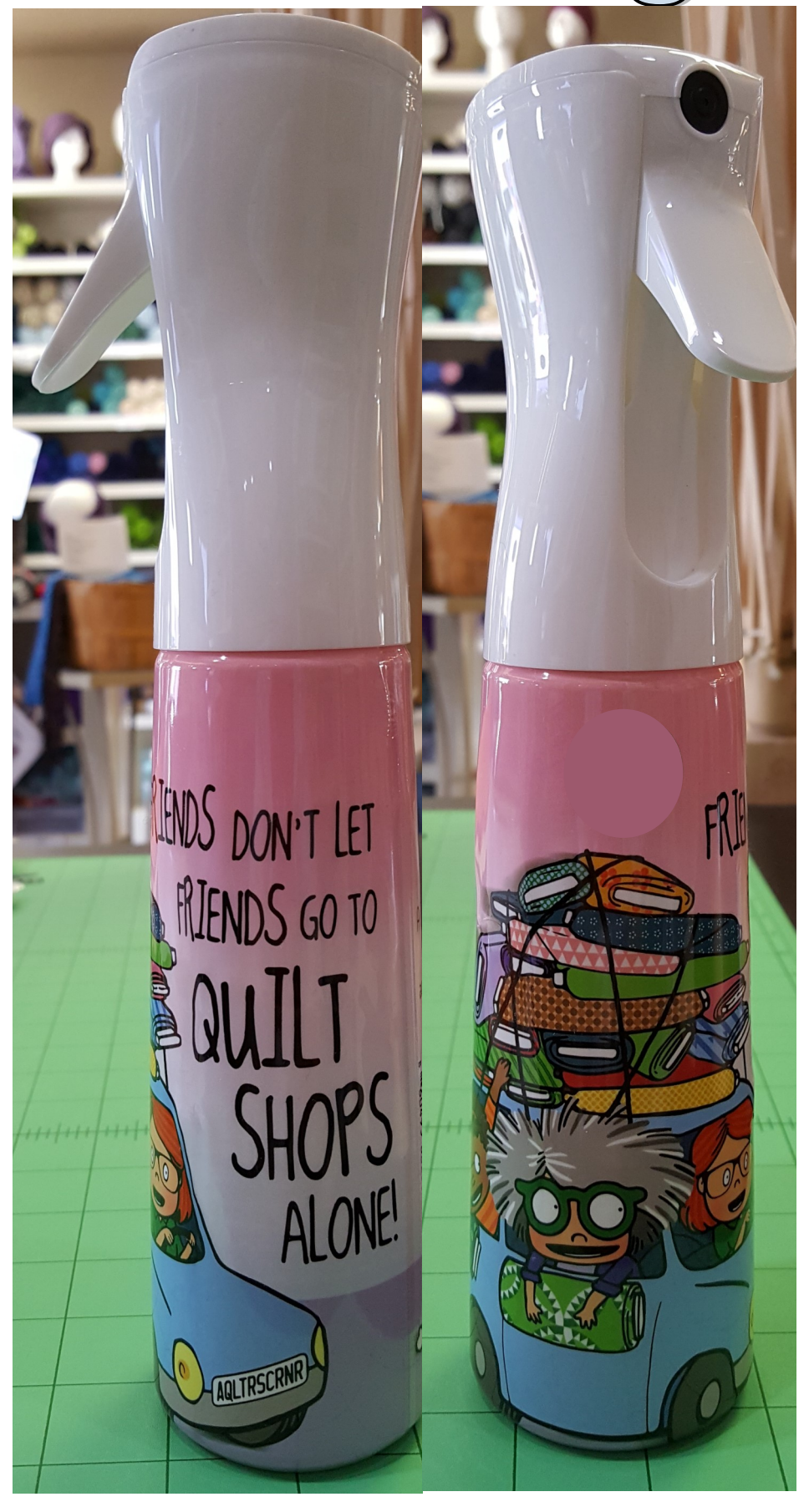
Spray bottle Friends don't let friends go to QUILT SHOPS ALONE!