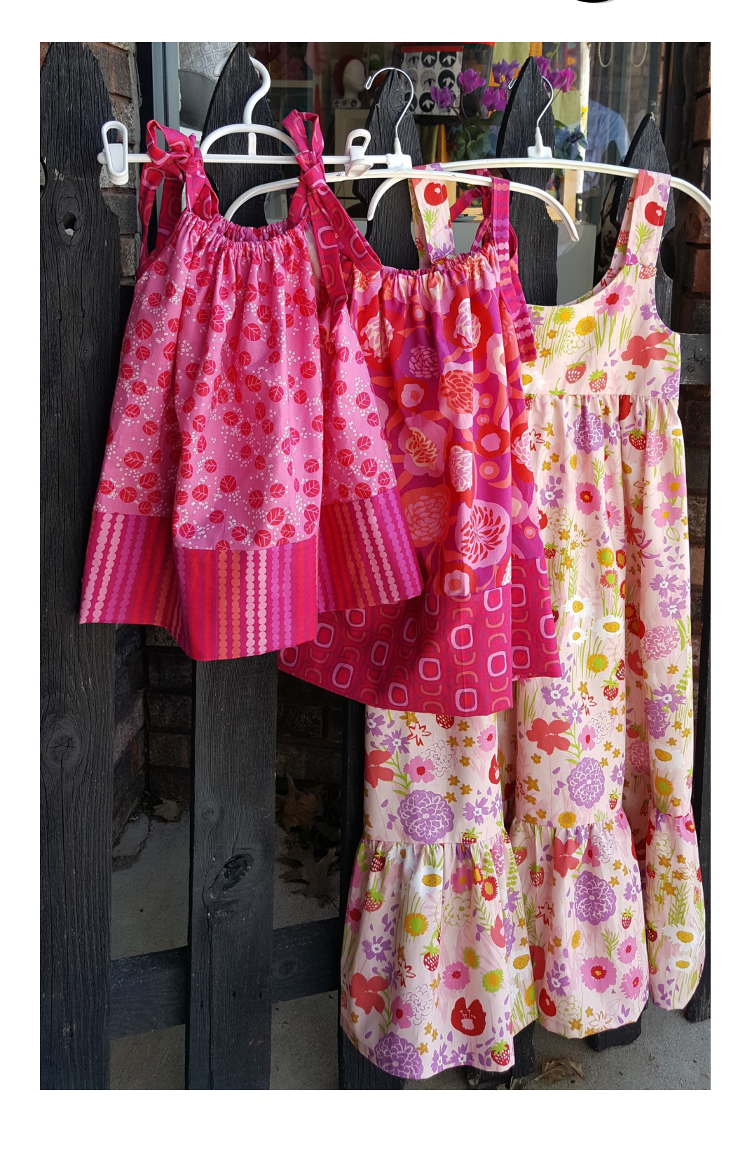
Fabric & Patterns Available